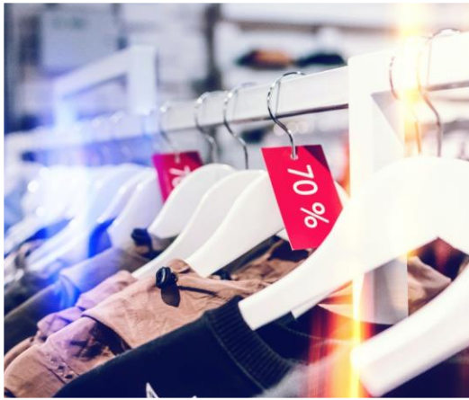
Fashion & Design

Three areas with high market growth potential, and high environmental and social impact challenges.