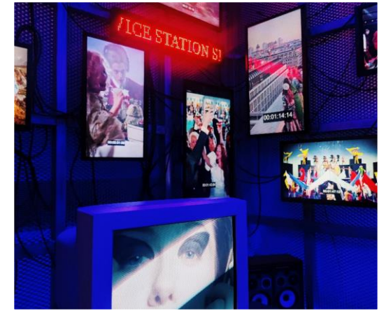
Audiovisual & videogames