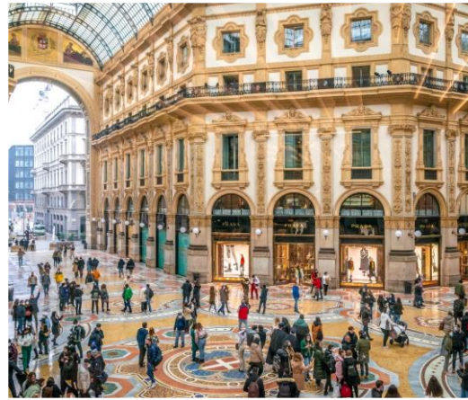
Architecture & Heritage